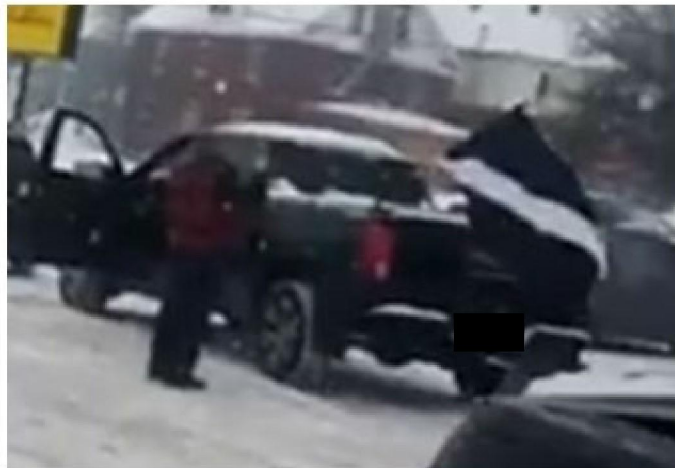
Freedom Convoy Demonstration – Sudbury, Ontario (2022-01-22)